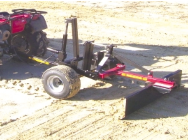
48" CATEGORY 0 GRADER BLADE